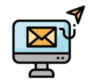
Newsletter Subscribers: 15,864