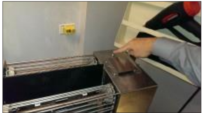
Figure 5. Conveyor Interlock Safety Switch