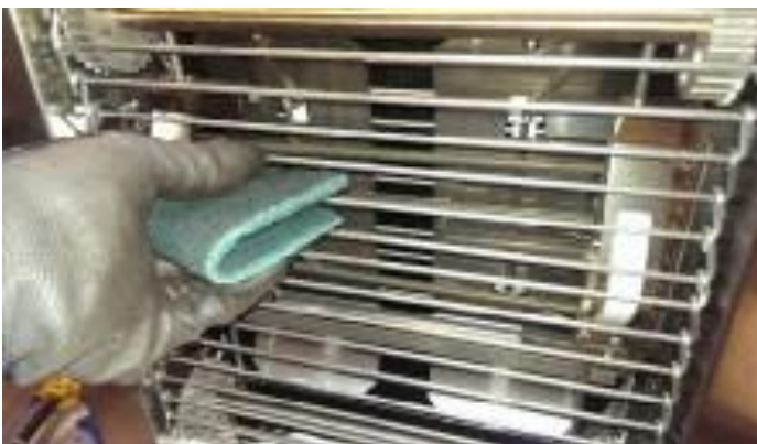
Figure 4. Cleaning Conveyor Belt Chain Link