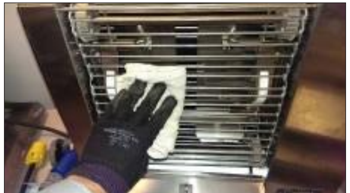
Figure 6. Sanitizing Conveyor Belt Chain