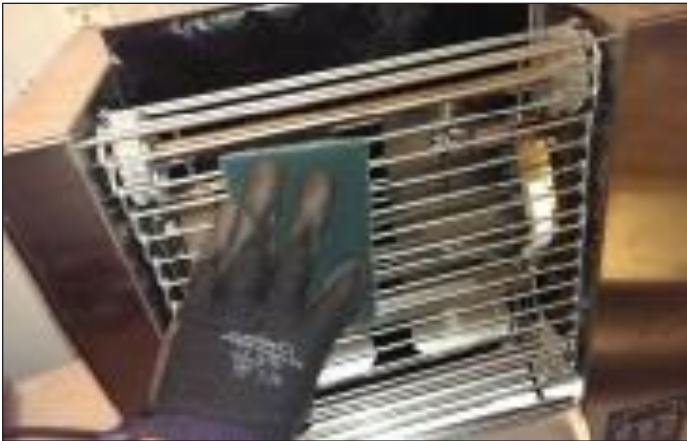
Figure 3. Cleaning Conveyor Belt Chain