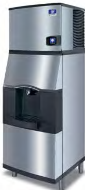
Indigo NXT iT0450 Ice Machine SPA-310 Ice Dispenser

With Indigo and Indigo NXT ice machines you can program the ice machines to be off certain hours of the day so that while the hotel guests are sleeping, the ice machine can be too!