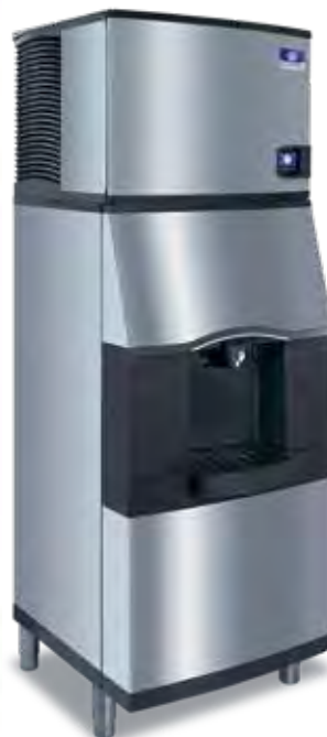
Indigo NXT iT0450 Ice Machine SFA-291 Ice & Water Dispenser