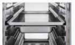
Suitable for both full size sheet pans and GN1/1 pans