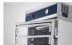
Multi-deck Flip Door (optional)