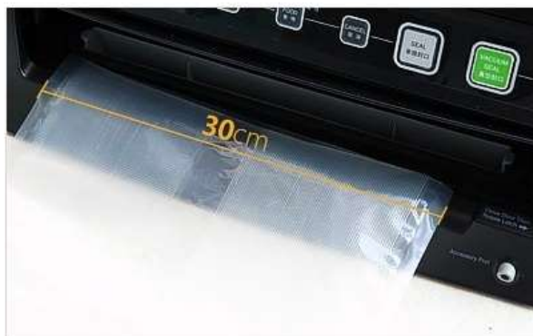
Super - wide adaptability