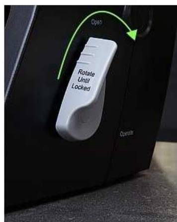
Easy to lock closure