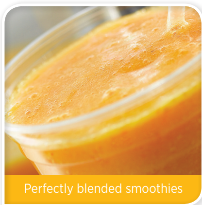
Perfectly blended smoothies