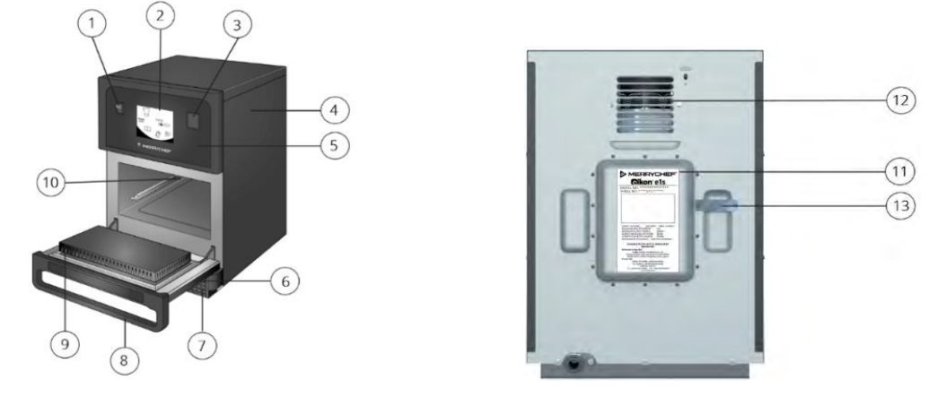
Figure 1.2: e1s front and rear views – parts and safety devices