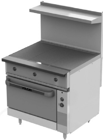
Model EV36S-3HT208 shown with adjustable legs