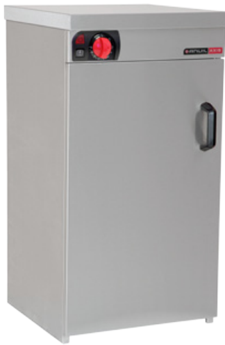
Plate Warmer Cabinet Single Door

"Anvil's Plate Warmer Cabinet has been designed to keep up to 60 plates at the ideal serving temperature."