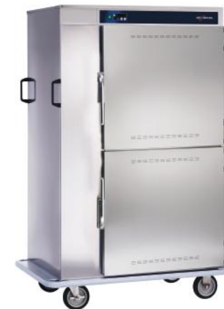
1000-BQ2/96 Shown with split door option