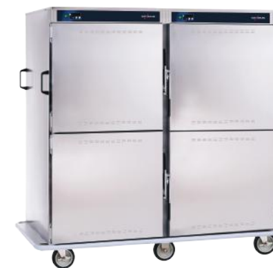
1000-BQ2/192 Shown with split door option