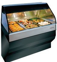
ED3-48 Stationary Base