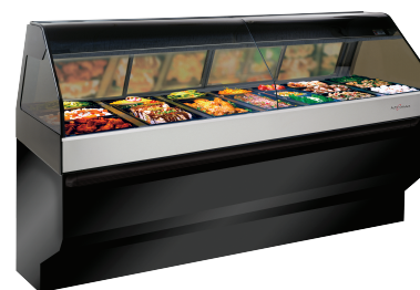
ED3-96 Stationary Base