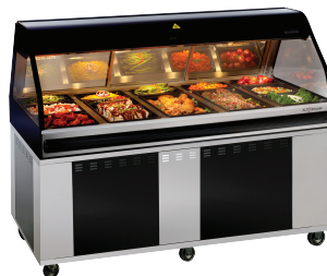
ED3-72 Mobile Base