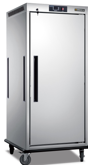
HEAT MOBILE BANQUET CART