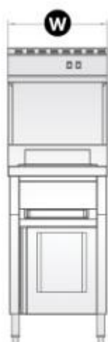
[FFDS-500] [front view]