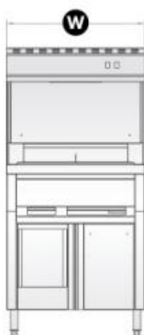
[FFDS-716] [front view]