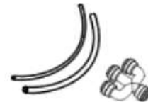
Tubing ship 3-in fitting