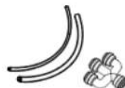
Tubing ship 3-in fitting