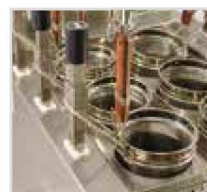
Auto-Lift Noodle Basket