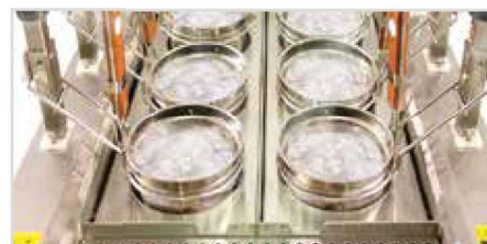
High volume heating for faster cooking