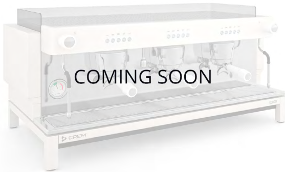
EX3 3GR CONTROL