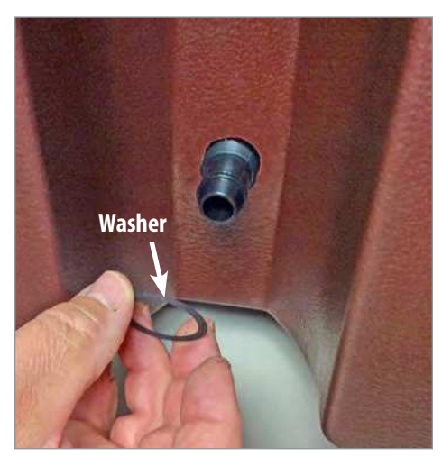
FIBER WASHER - remove it from the assembly.

NOTE: When loosening the hex nut, you may want to apply pressure to the spout from the inside of the Camtainer well to help prevent the spout from turning with the hex nut.