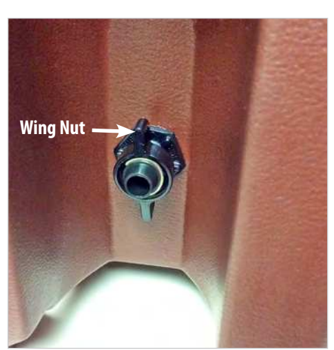
Turn the wing nut CLOCKWISE to loosen (reverse thread) until the faucet comes out.