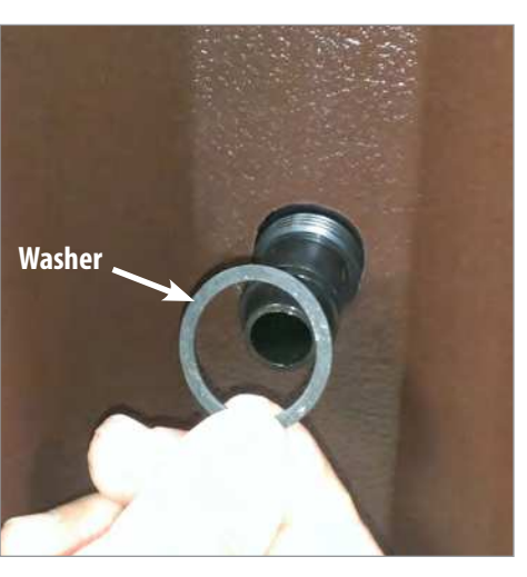
From the outside, put on the thinner fiber washer.