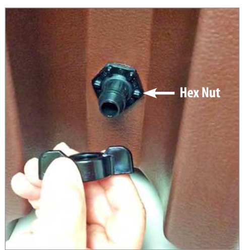
Now with the wing nut loose, use the wing nut as a tool to turn the hex nut to the LEFT to loosen so that the spout can be removed from the body of the beverage server.

HEX NUT. Engage the wing nut lobes to those on the hex nut face.