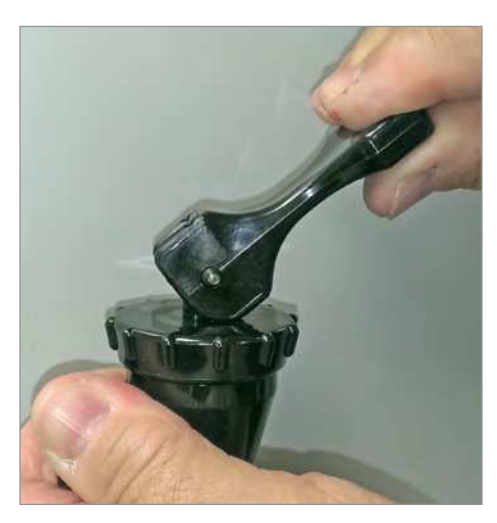
FEATURE NOTE: Set the faucet to whichever mode you need—in steady-flow mode or as a dispenser by rotating the faucet lever accordingly.

Rotate the lever to the flat shape at the lever base for steady flow or to the round or radius shape on the base for dispensing.