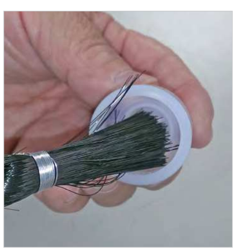
Using a warm, sudsy solution, clean the insides with a brush or soft towel. Rinse and dry.