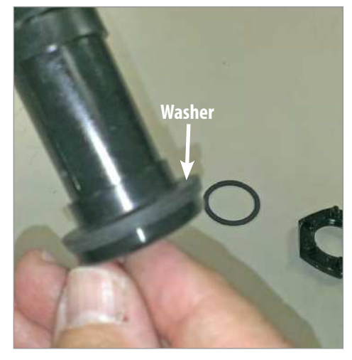
Place the rubber seal washer back on the spout sleeve in the groove on the flared end.