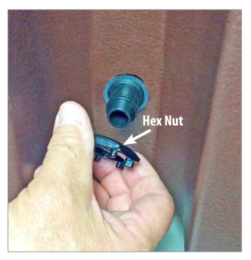
Remove the hex nut.

NOTE: When loosening the hex nut, you may want to apply pressure to the spout from the inside of the Camtainer well to help prevent the spout from turning with the hex nut.