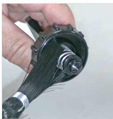
Clean the coil area on the faucet lever stem as well as around the inside area of the lever cap.