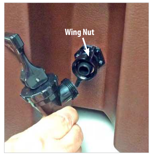
To remove the body of the faucet from the spout, first locate the wing nut towards the back area of the faucet.