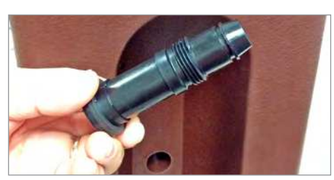
Push the spout backwards into the body well of the beverage server to remove it.