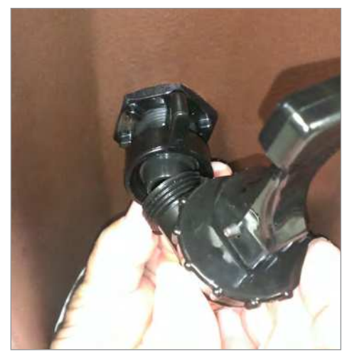
Screw the faucet back on using a COUNTER-CLOCKWISE motion to tighten the wing nut securely so as not to leak.