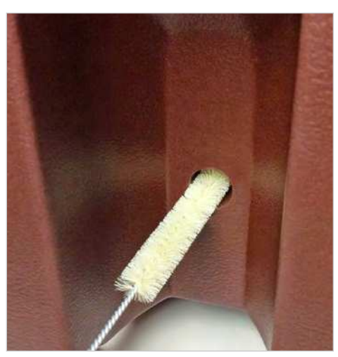
Use the bottle brush to also clean the spout drain port in the body of the beverage server. Rinse and dry.