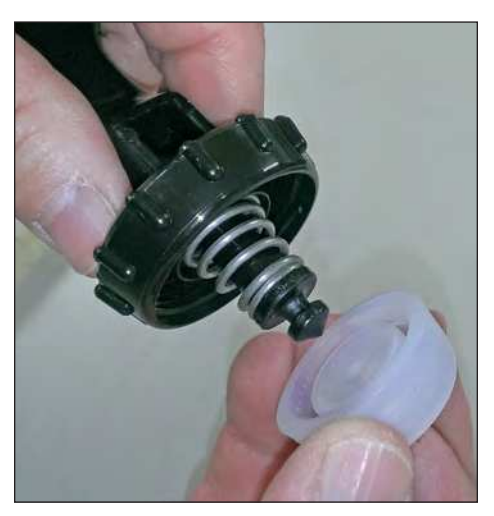
Take the silicone seat cup off the faucet lever stem assembly.