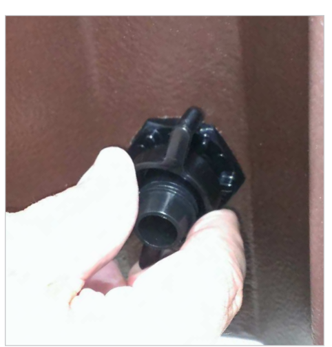
Using the wing nut like a wrench, tighten the hex nut by engaging the lobes on both by turning to the right or in a CLOCKWISE direction.