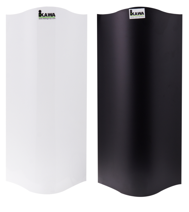
Double the UV Tubes to achieve the best catch!