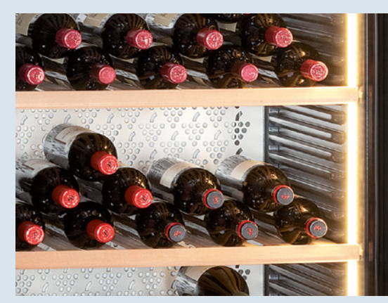
Wooden shelves: The wooden shelves are ideal for storing Bordeaux bottles. They can be stored in opposite directions to make full use of the capacity.

LED lighting: The tinted glass door provides not only a perfect UV protection, but also an optimum glance at wine. The integrated LED lighting ensures a pleasant illumination of the complete interior.