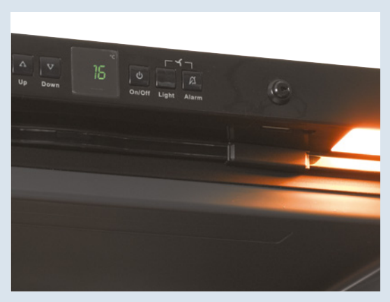
Integrated lock: Nicely concealed at the top of the control panel area, this sturdy lock protects your fine wine collection.