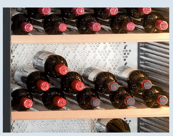
Wooden shelves: The wooden shelves are ideal for storing Bordeaux bottles. They can be stored in opposite directions to make full use of the capacity.

The WKb 4611 wine cabinet mimics the conditions of an underground wine cellar. Its solid door creates a dark, undisturbed environment with zero exposure to UV light and heat fluctuations – perfect for maturing wines. This unit ensures a constant interior temperature, which can be adjusted between +5 °C and +20 °C. Wines are always stored safely on our untreated wooden shelves while the activated charcoal filter provides optimal air quality. The ergonomic slimline door handle with integrated opening mechanism makes the door easy to open with very little effort. For added flexibility, optional accessories<sup>1</sup> are available.