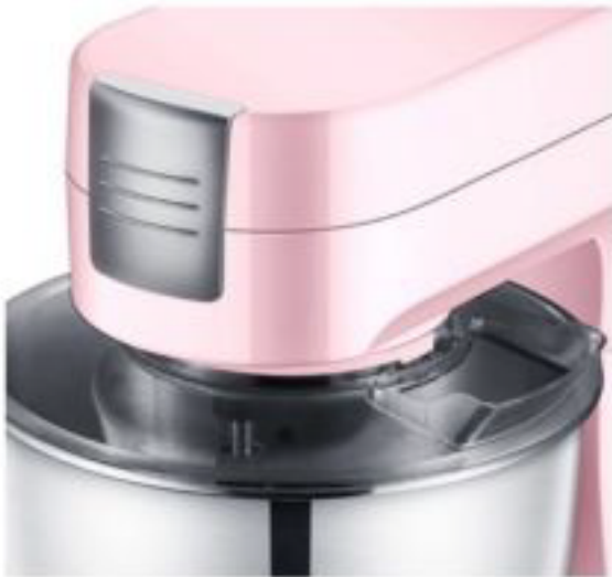
Transparent Safe Guard