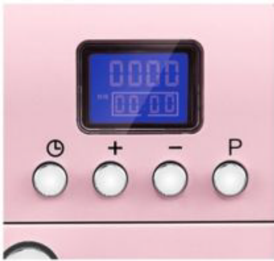
Large LED Screen Display