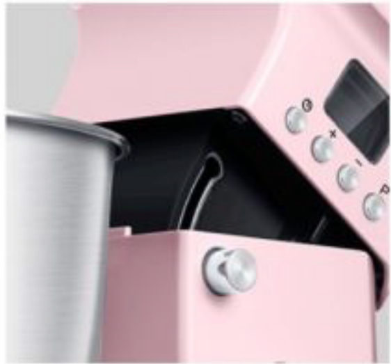
Safe And Easy To Open