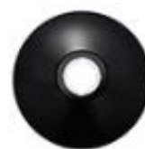
4 Dust cover