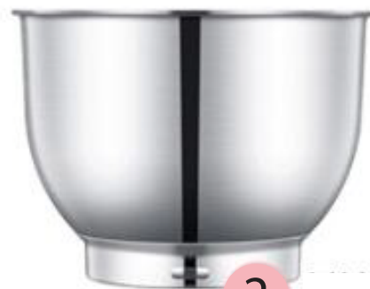
2 Mixing bowl