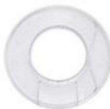
3 Splash guard