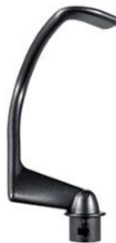
7 Dough Hook