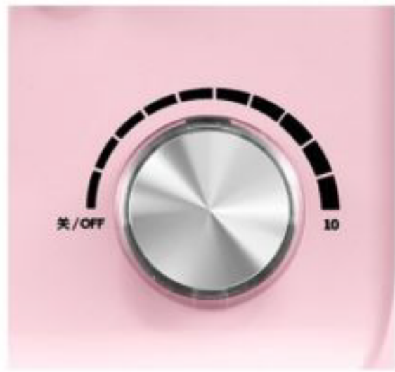
10 Speeds + Speed Control