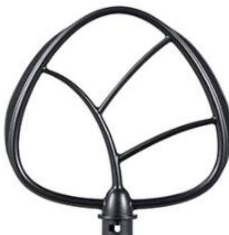
6 Y Mixing Propeller