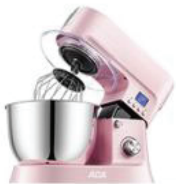
A Pinky Cute Machine