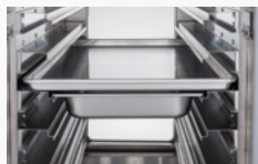
适用全型面包盘 660*460*25 或者 1/1GNP Accommodated for both full size sheet pan and 1/1GNP