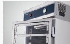
翻转门 (可选) Multi-deck Flip Door(optional)