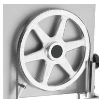
Hermetic upper pulley