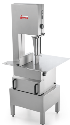
Sirman Bone Saws , model SO 2400 Inox :

Sirman Spa Viale dell'Industria 9/11 35010 PIEVE DI CURTAROLO (PD), Italy Tel./Fax. +39 049 9698666 / +39 049 9698688 email: info@sirman.com