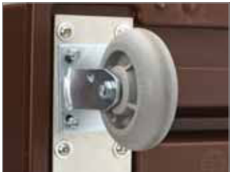
Shown with optional HD casters.