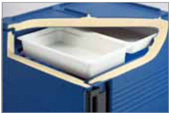
Polyurethane insulation keeps hot food hot and cold food cold.